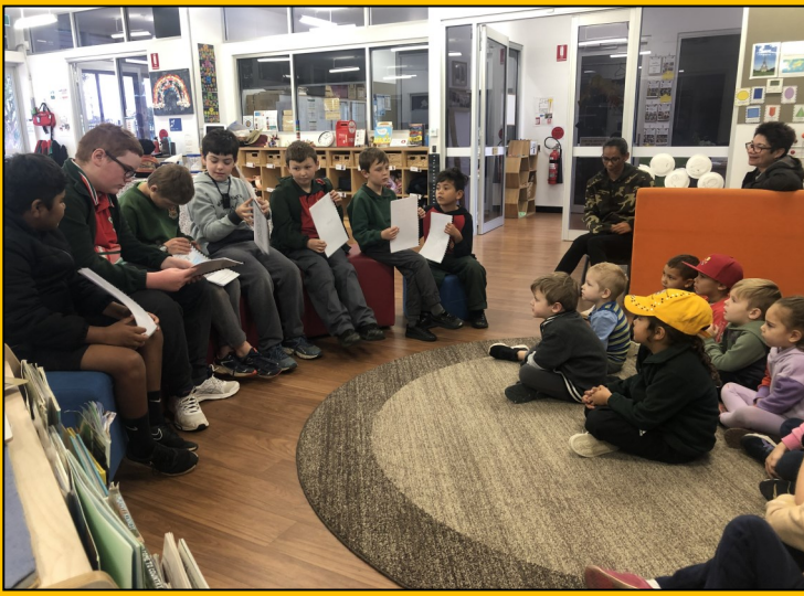
Wilay's classroom sharing their imaginative stories. These books were bound and shared with infants and preschool students.